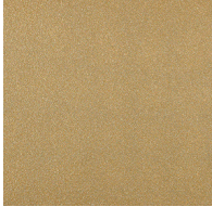
Olive Breeze - 30 (OBR)